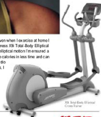
X9 Total Body Elliptical Cross-Trainer

I dream big, I aim high. And I don't make excuses. Even when I exercise at home I insist on a health-club quality workout, and the Life Fitness X9 Total-Body Elliptical Cross-Trainer delivers. With the purest, most natural elliptical motion I'm ensured a smooth ride so I can train more effectively, I burn more calories in less time and can access up to 25 workouts to maintain variety in my cardio routine. With the X9 I don't just meet my fitness goals, I exceed them.