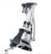
23 Cycle Motion™ Spin System