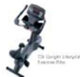
23 Weight Lifters™ Exercise Bike