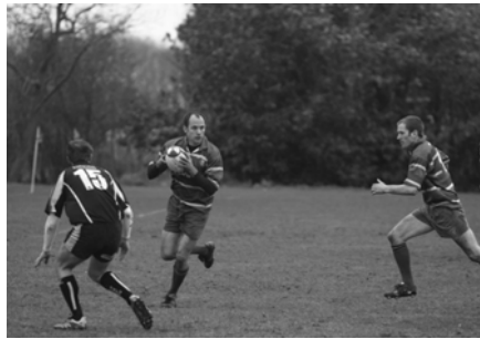
Pikey sizes up the options