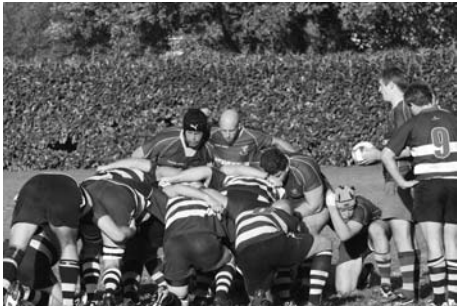
Packs engage in the Banbury game